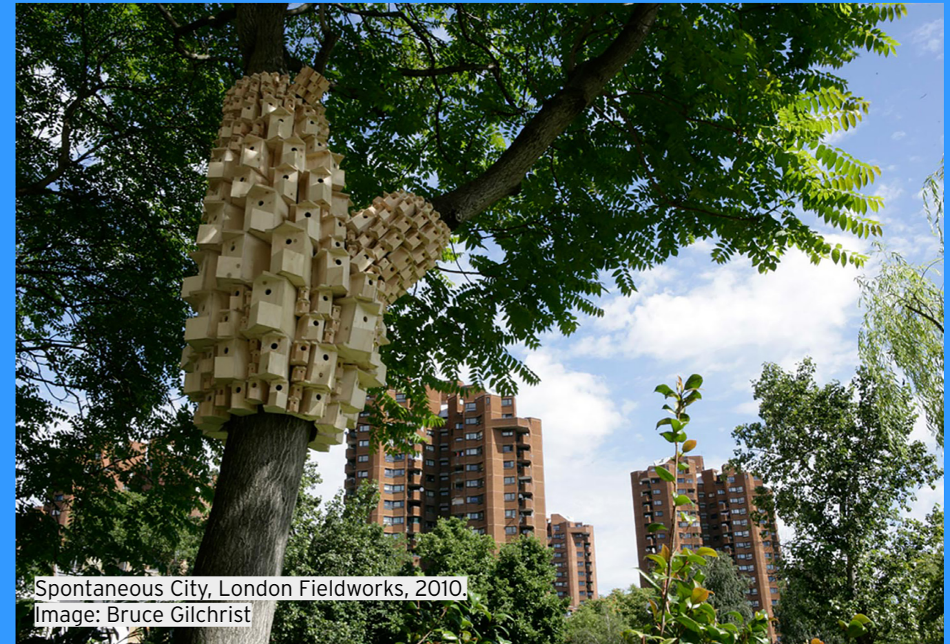
Spontaneous City, London Fieldworks, 2010.