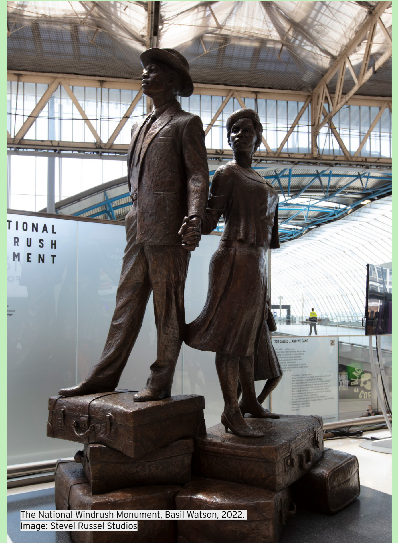
The National Windrush Monument, Basil Watson, 2022.