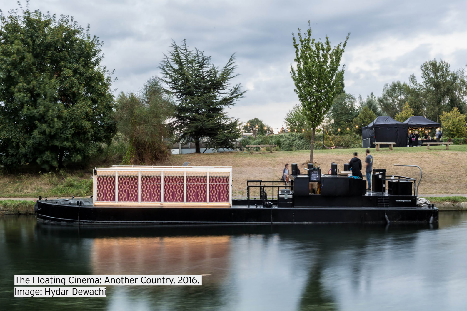
The Floating Cinema: Another Country, 2016.