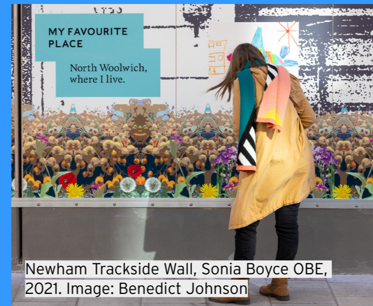
Newham Trackside Wall, Sonia Boyce OBE, 2021.