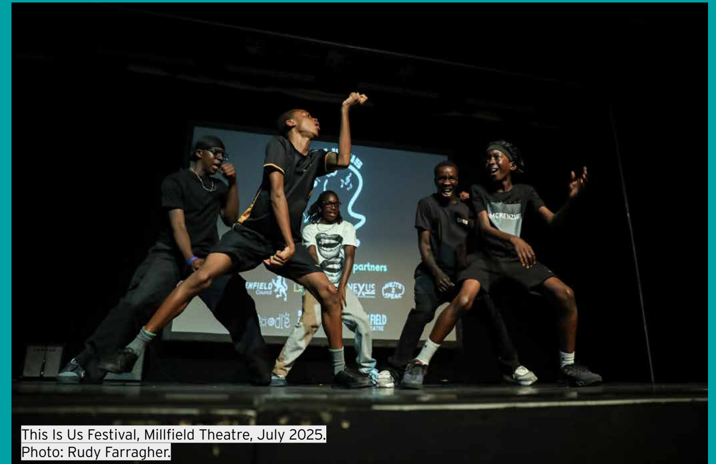
This Is Us Festival, Millfield Theatre, July 2025.

With access , collaboration and ambition at their core, these initiatives will become action research, driving change in how creatives and young people work together to inform a new cultural strategy as well as a thriving creative network in Enfield.