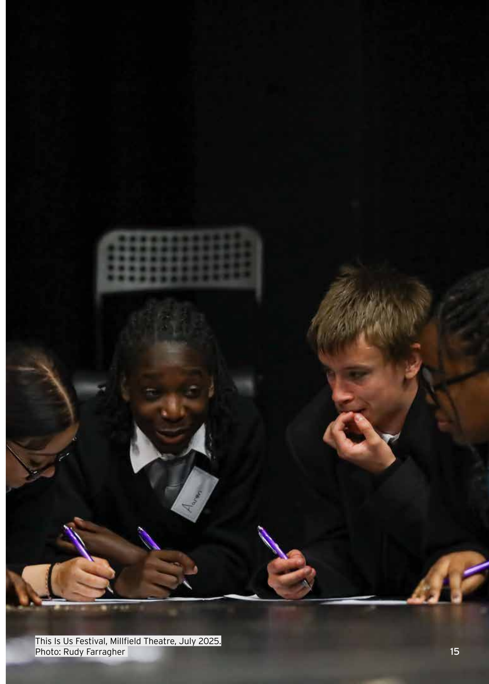
This Is Us Festival, Millfield Theatre, July 2025.