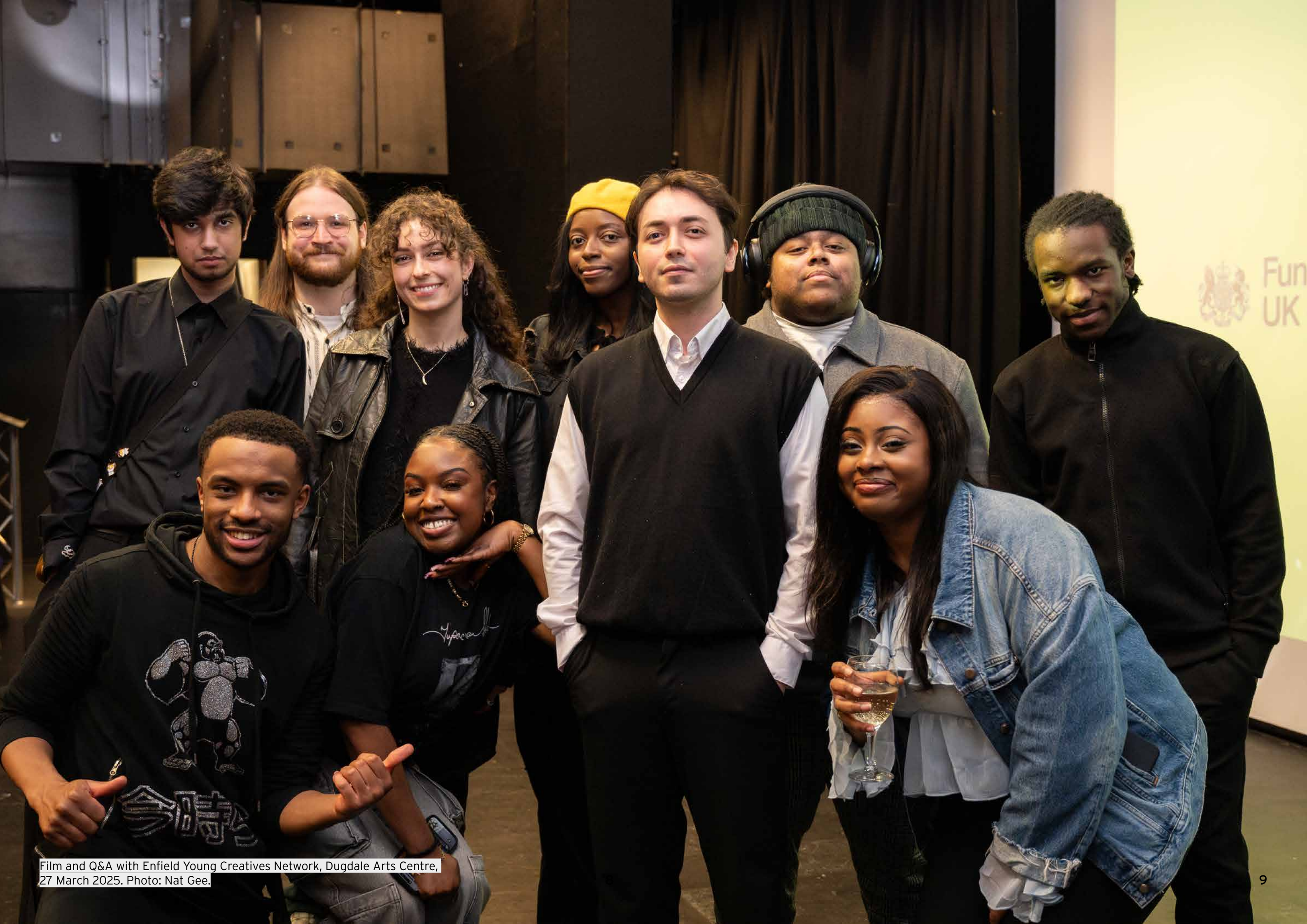
Film and Q&A with Enfield Young Creatives Network, Dugdale Arts Centre, 27 March 2025.