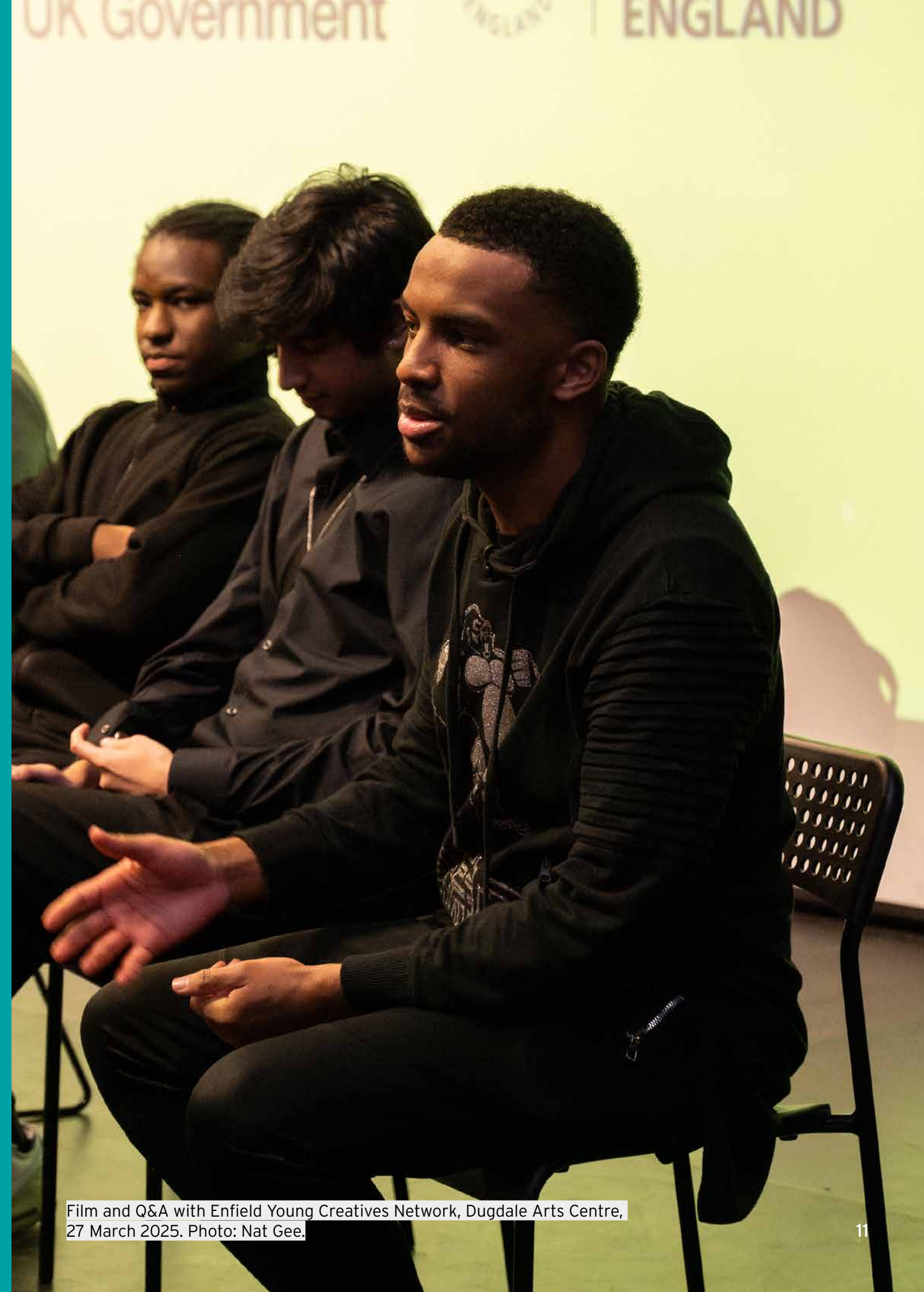
Film and Q&A with Enfield Young Creatives Network, Dugdale Arts Centre, 27 March 2025.

Should you have any questions relating to this opportunity please address them via email to workwith@upprojects.com .