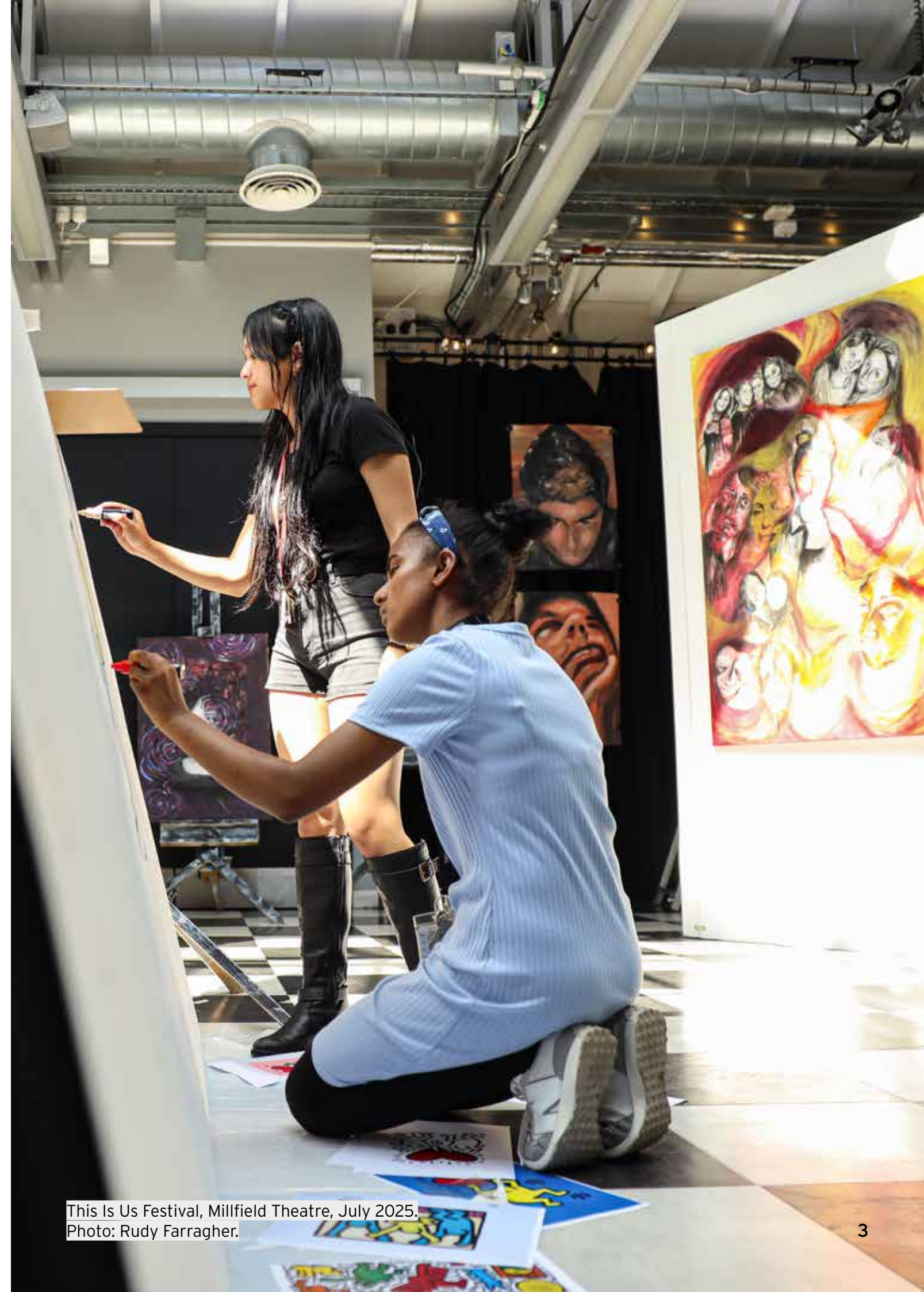
This Is Us Festival, Millfield Theatre, July 2025.

Please read on for further information details of how to apply.