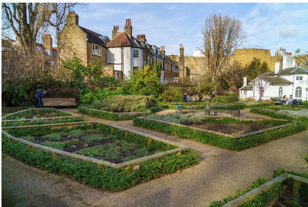
St Mary's Lodge and the Herb Garden - © The Royal Parks