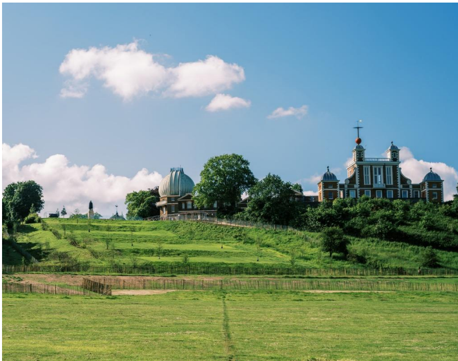
The Grand Ascent and Royal Observatory Greenwich, Greenwich Park

For more information, please visit: www.royalparks.org.uk/visit/parks/greenwich-park/greenwich-park-revealed