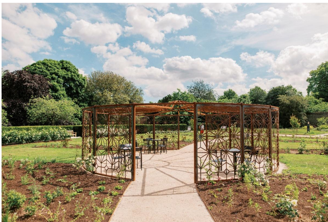
Pergola in the Rose Garden by Heather Burrell - © The Royal Parks