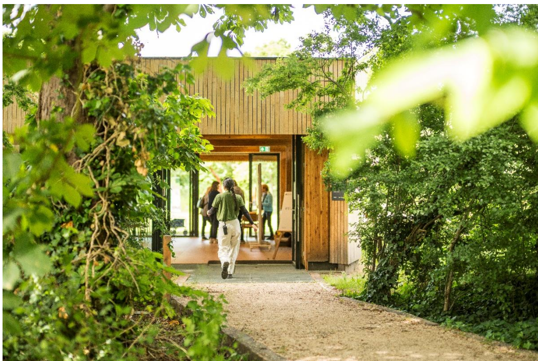
Greenwich Park Learning Centre: classroom entrance - © The Royal Parks