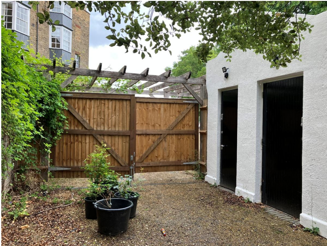
St Mary's Lodge (courtyard)