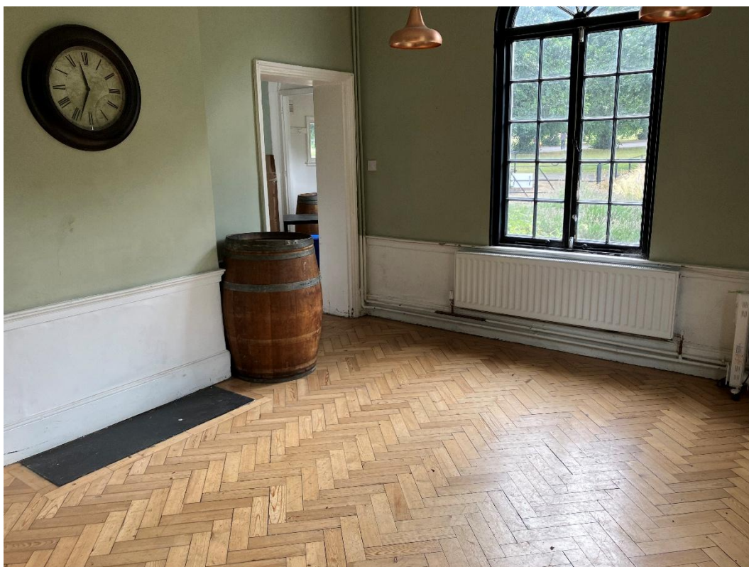
St Mary's Lodge (interior)