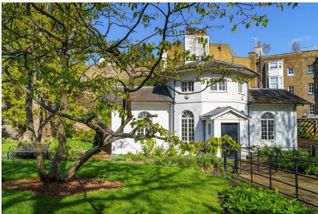
St Mary's Lodge (exterior) - © The Royal Parks