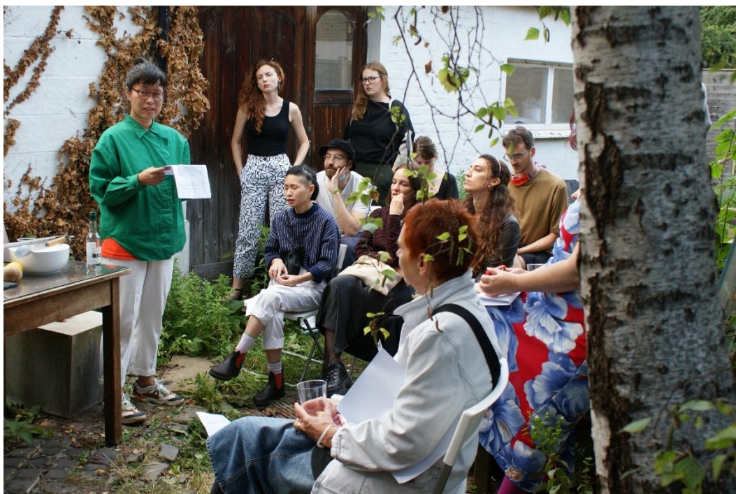
Constellations 2020-21 Final Event - Umbra, Penumbra, Antumbra, 'Radical Cocktails' by Constellations ° Cohort 2020-21, Flat Time House.