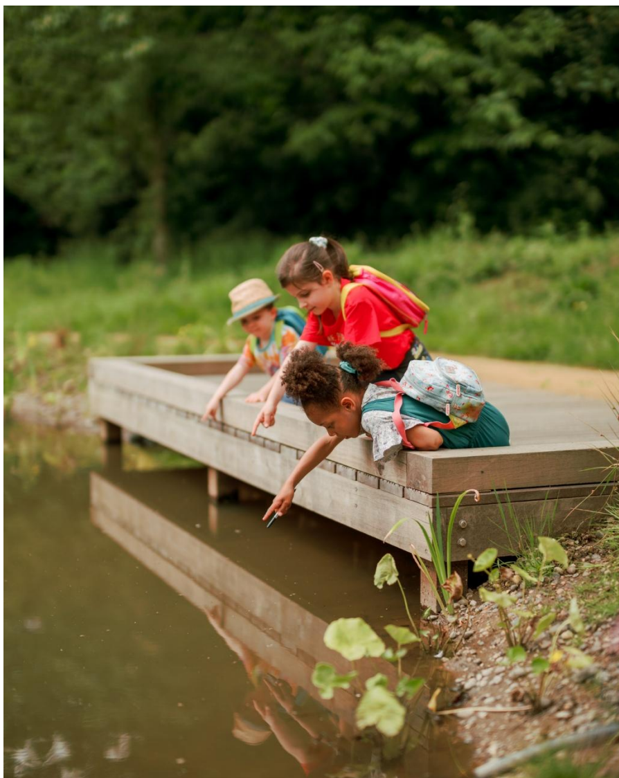
Children enjoying a 'Welcome Day' event at the Greenwich Park Learning Centre