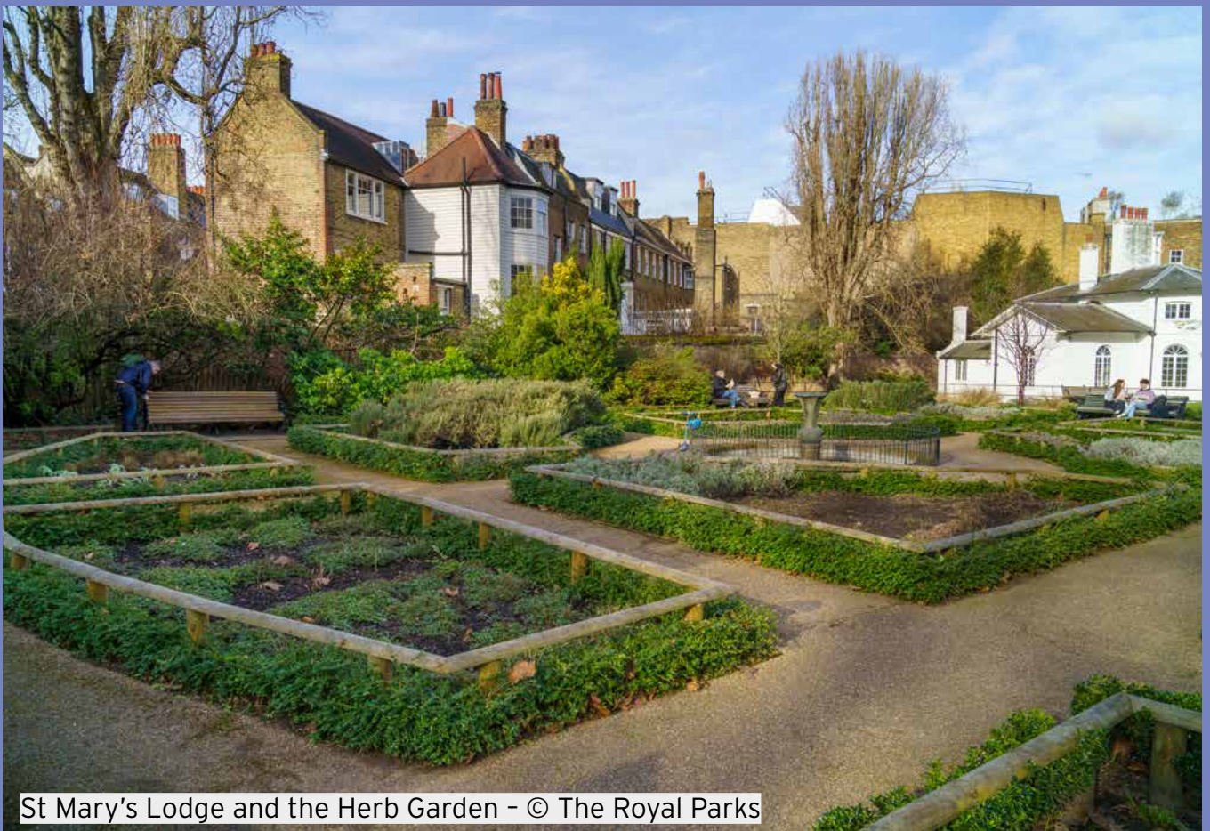
St Mary's Lodge and the Herb Garden