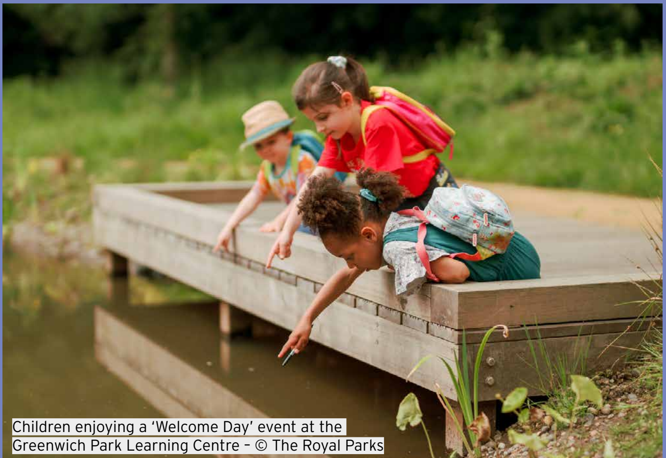
Children enjoying a 'Welcome Day' event at the Greenwich Park Learning Centre