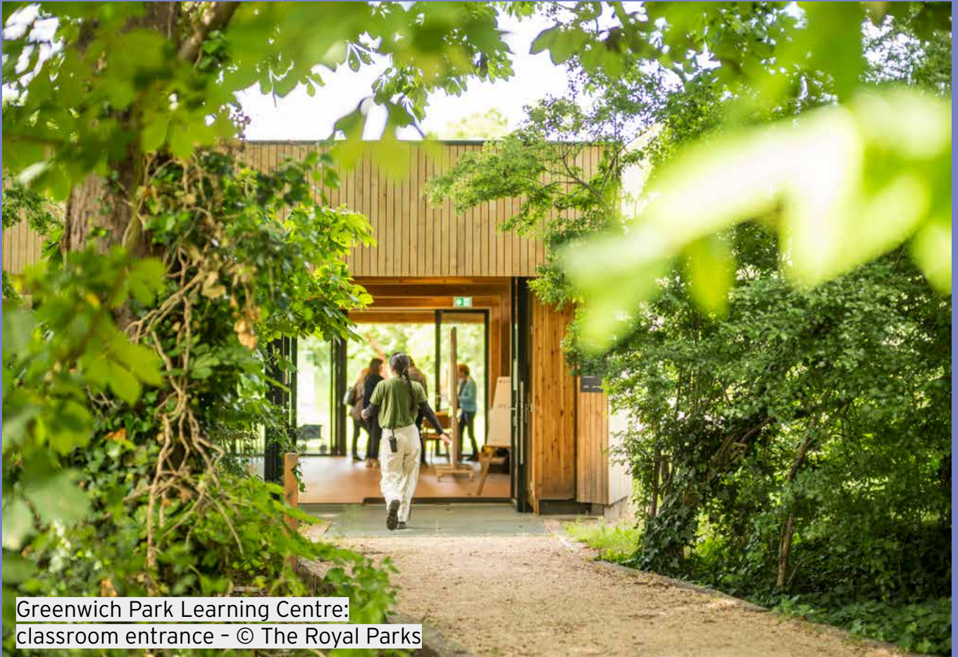
Greenwich Park Learning Centre: classroom entrance