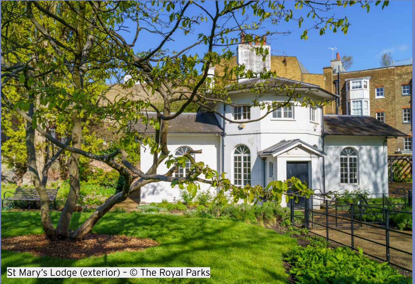
St Mary's Lodge (exterior)