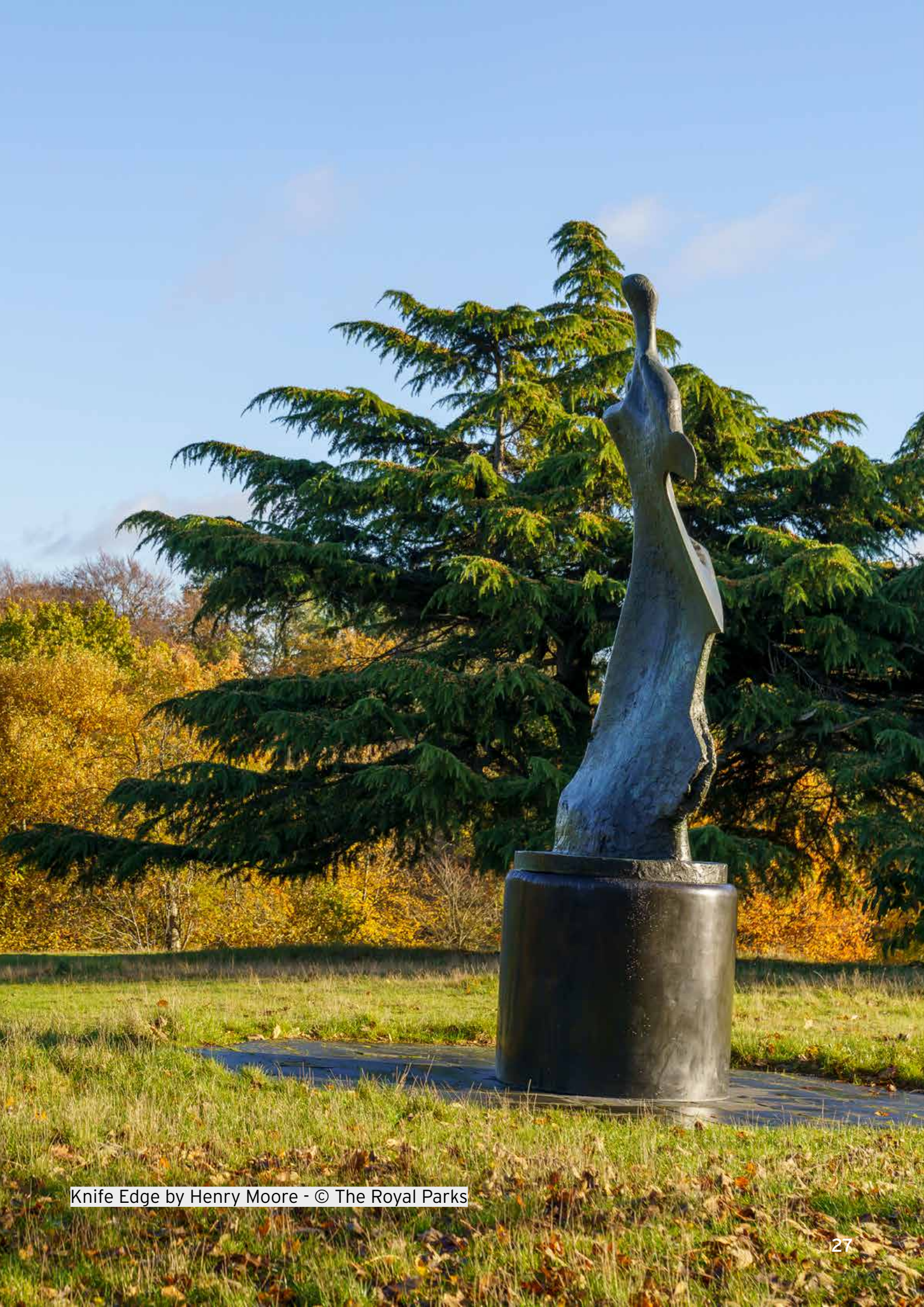
Knife Edge by Henry Moore