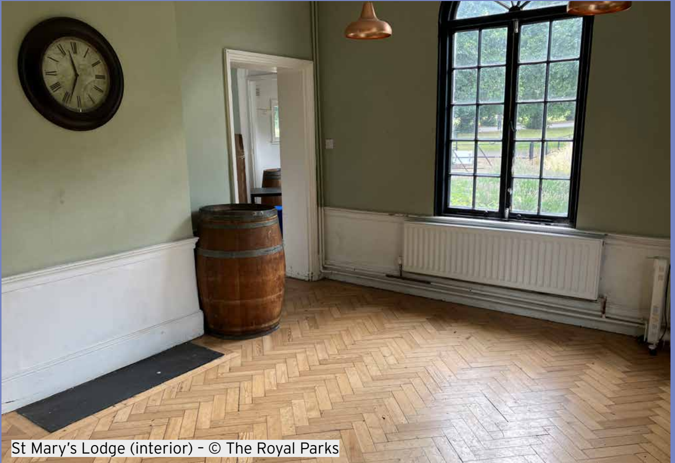
St Mary's Lodge (interior)