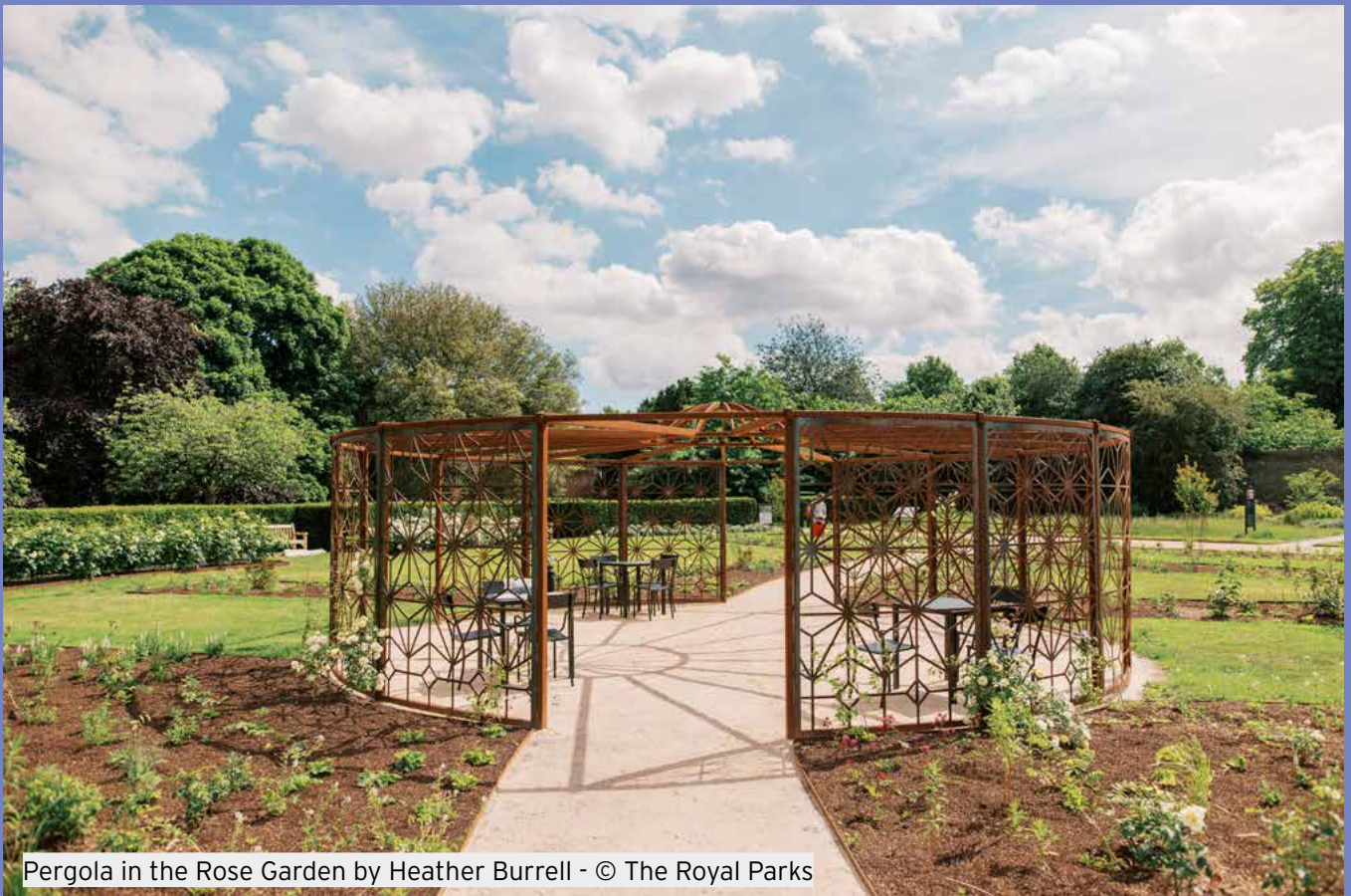
Pergola in the Rose Garden by Heather Burrell - © The Royal Parks