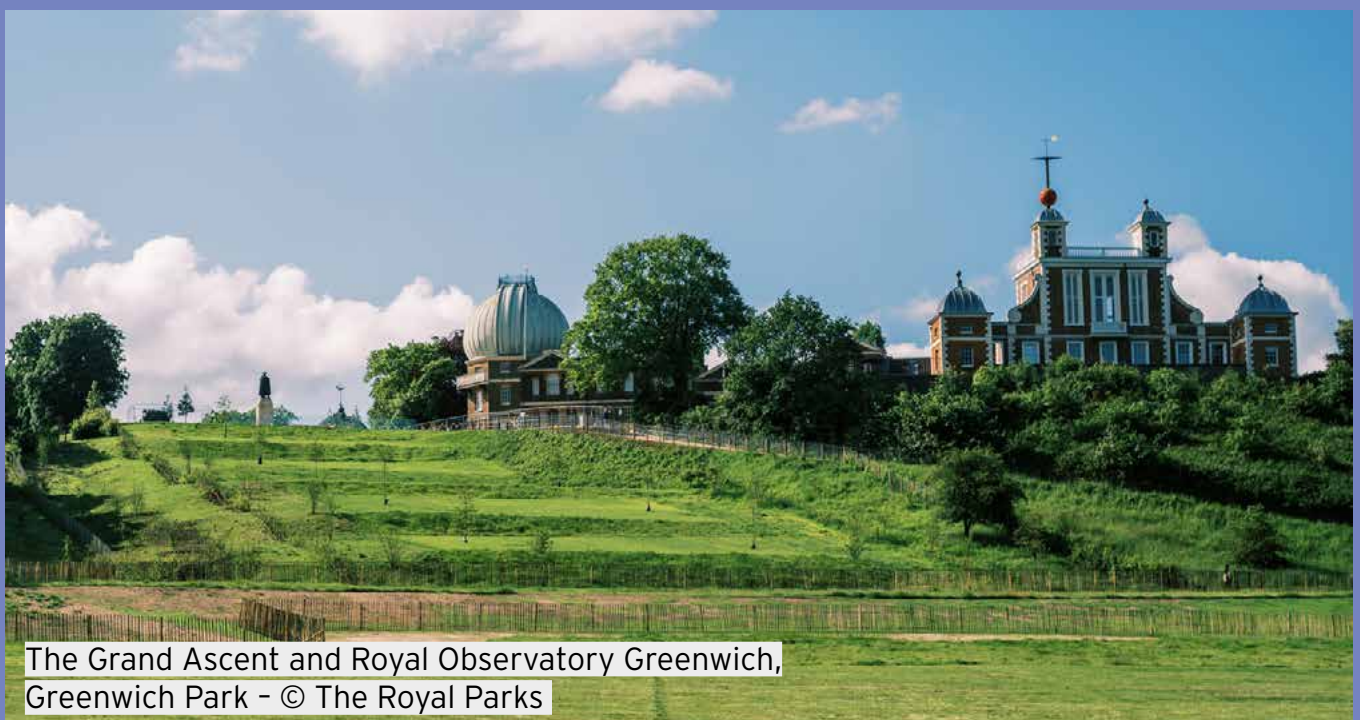
The Grand Ascent and Royal Observatory Greenwich, Greenwich Park

For more information, please visit: www.royalparks.org.uk/visit/parks/greenwich-park/greenwich-park-revealed