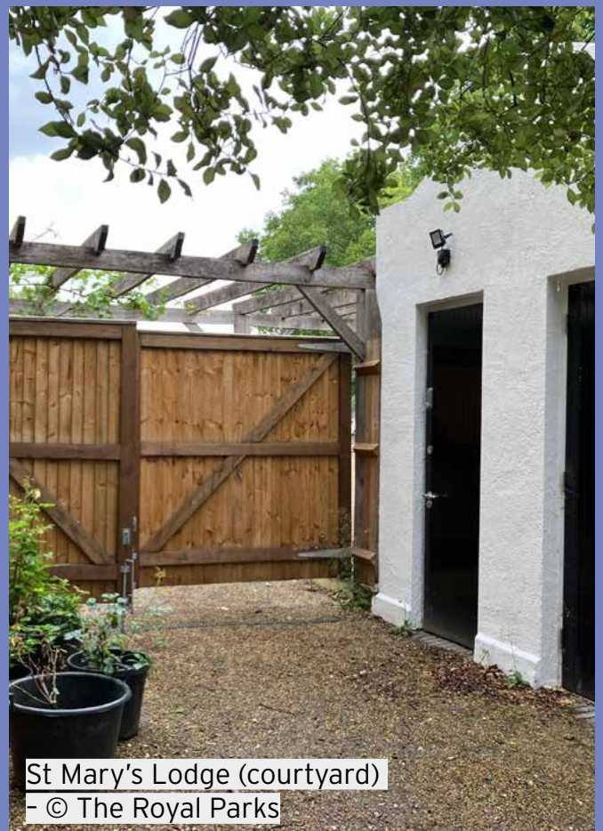
St Mary's Lodge (courtyard)