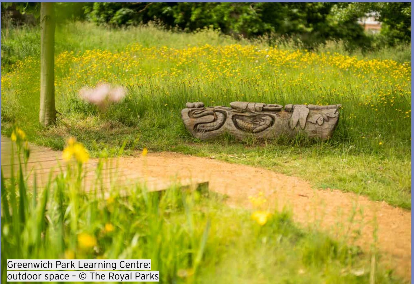
Greenwich Park Learning Centre: outdoor space