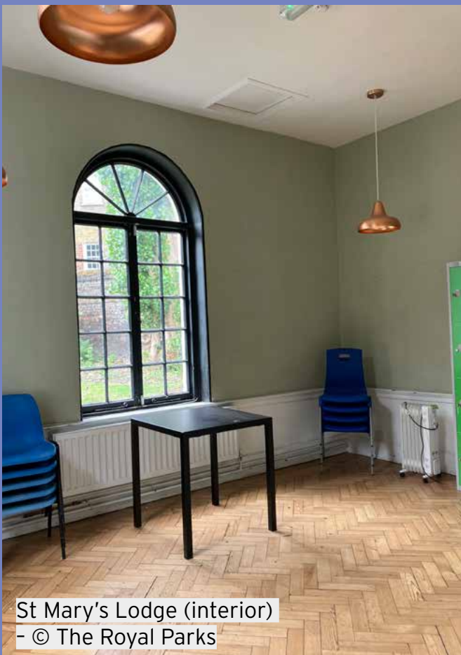
St Mary's Lodge (interior)